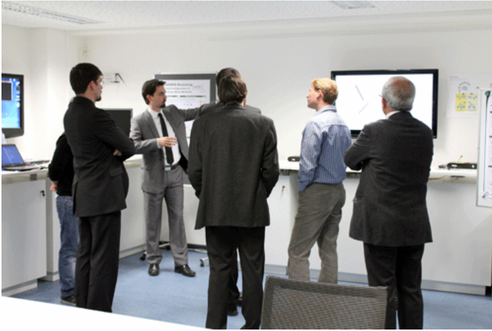
Three instances of the performance of testbed demonstrations and presentations during the final audit of the project which was held in Berlin (Germany) on January 28 th , 2010.